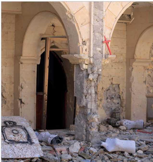
THE DESECRATED CHURCH OF THE IMMACULATE CONCEPTION IN QARAQOSH, USED BY ISIS FOR TRAINING FIGHTERS AND TARGET PRACTICE

This section discusses some of the challenges that displaced minority members continue to experience in Iraq almost three years after the fall of Mosul to ISIS.