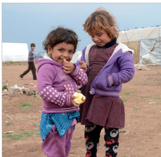
IDP CHILDREN, NORTHERN IRAQ / ALESSANDRO MANNO

In the first two weeks of August, ISIS expanded its occupation of northern Iraq, capturing Sinjar, Mosul Dam, Kocho and other areas north and west of Mosul, as well as Qaraqosh and other towns and villages to the south and east. The group subsequently advanced to within 40 kilometres of Erbil, capital of the KR-I.